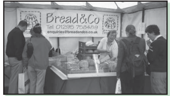
Bread & Co