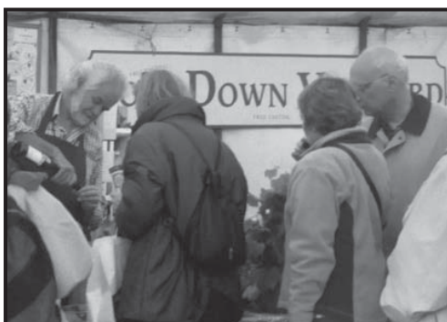
Boze Down Vineyard

Foxbury Farm from Oxfordshire sold their own produce and helped those food group members who had not been able to be there in person. We also had two more members in the tent – Boze Down Vineyard from Berkshire and Bread & Co. near Banbury.