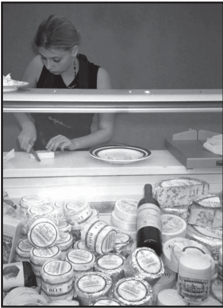
Oxford Cheese Company won Bronze for Blue Cheese and Silver for Export Cheeses