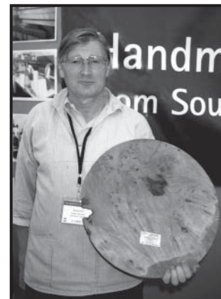
Rodney Whitworth Abbeygold Cheese won the Cheese Lovers’ Trophy, Gold for Blue