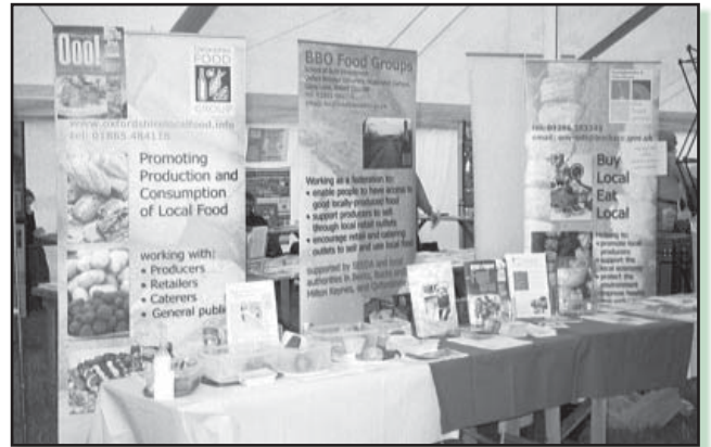
BBO Food Group Stand

fairs and it was heartening to see the number of local food producers, a majority of them also members of the Food Group, growing in attendance each year. It is evident that people are becoming more aware of local food producers and this type of event helps to further the value of buying locally and supporting the local economy."