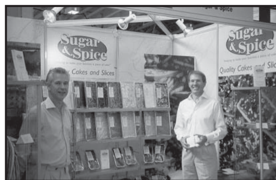
Sugar and Spice at the 2004 Speciality and Fine Food Fair