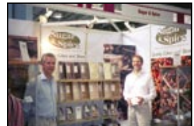
The Speciality and Fine Food Fair, London