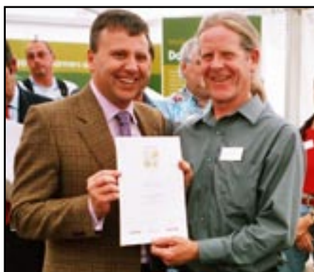
Tolhurst Organic Produce, Oxon at the Royal Show