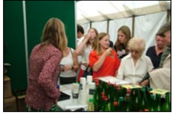
Benson Fruit Juices, Glouc.