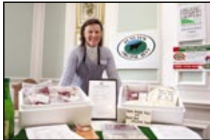
Duns Tew Organic Beef, Oxon