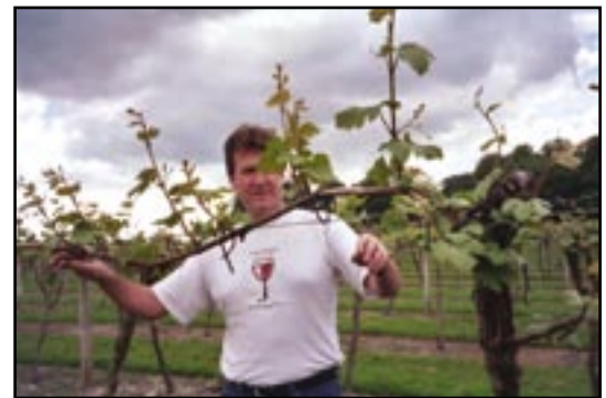
Brightwell Vineyard, Oxon