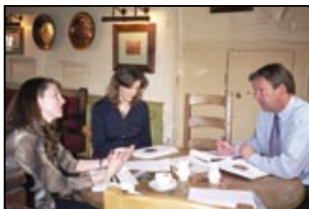
Copas Turkeys presenting to Waitrose