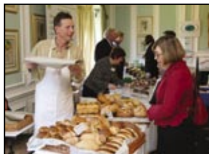
Bread & Co, Oxon

Four workshops were organised in Buckinghamshire and Oxfordshire which brought together more than 60 local B&Bs, hotels and restaurants. Buckinghamshire Tourism Officers were extremely helpful in organising their local workshop and bringing together 28 local B&Bs.