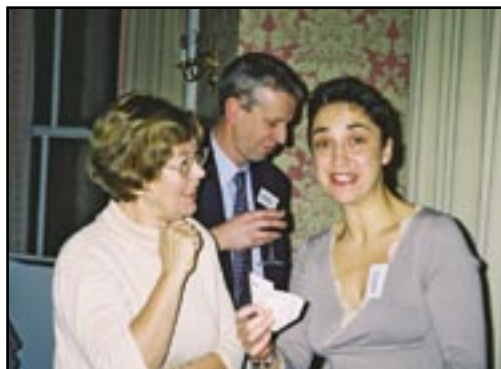
New consumer members

BBO Food Groups organised a series of 3-county meetings, such as the launch of the new website and of the new Membership scheme in December with 70 people attending and the Trade Show in February with more than 100 people attending.