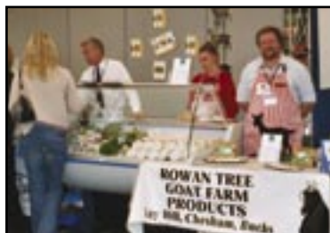
The Cheese Festival at Blenheim Palace