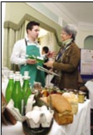
Local Tastes, Oxon