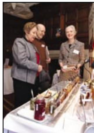
Susie's Preserves, Berks