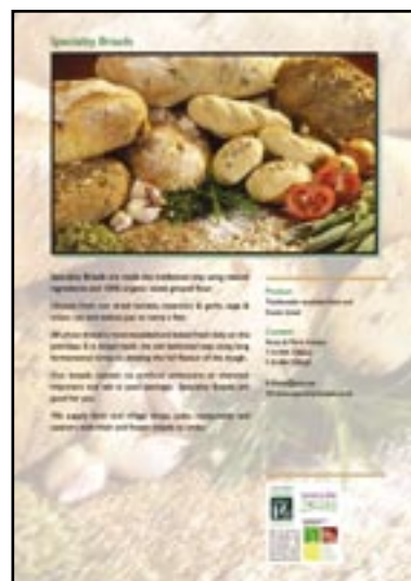
Speciality Breads, Bucks

Producers are encouraged quarterly to apply for this promotional tool which is subsidised by BBO Food Groups up to 50%.