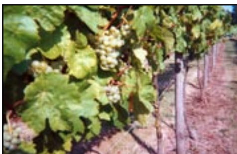
Binfield Vineyard, Berks