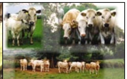
Duns Tew Organic Beef, Oxon