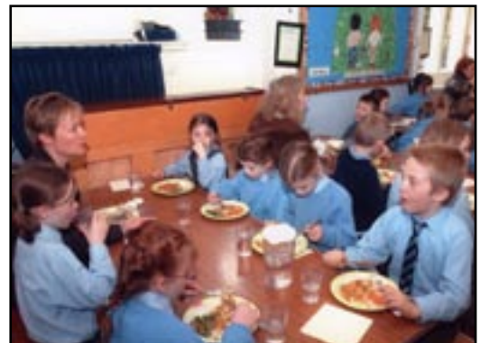
Ladymede School, Aylesbury, Bucks

At the same time, each school works to raise awareness about sustainable, healthy and nutritious food, and we will monitor uptake of school meals and satisfaction with the new menus. The environmental impact of using more local suppliers will be measured and three case studies will be produced for publication by DEFRA.