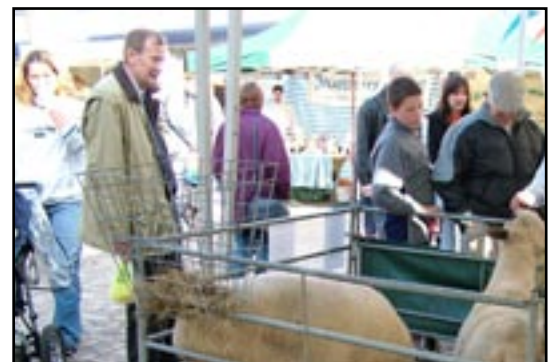
Berry Leys Farm, Bucks