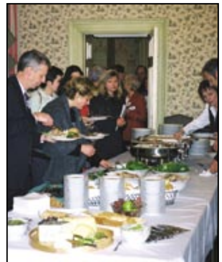
Local Foods Dinner at Headington Hill in Oxford