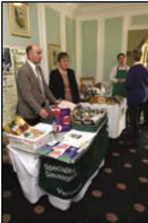
Woburn County Foods, Bucks

In March 2004 we evaluated the success of the 2002 Big Breakfast project in South Oxfordshire and decided to embark on the second phase of the initiative to promote local foods across the BBO area. Together with Tourism South East and South Oxfordshire District Council, BBO Food Groups developed a project plan and sought Food From Britain support in organising a 3-county Trade Show preceded by educational workshops for local hospitality providers.