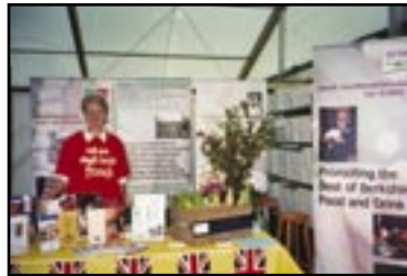
BBO Food Groups at the Newbury Show