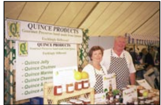
Quince Products, Oxon