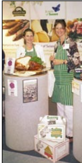
Copas Turkeys, Berks

The list of all BBO Food Groups members is on our website www.local-food.net/directory/