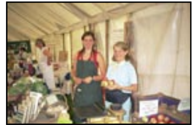
Cross Lanes Fruit and The Green Bean, Oxon at The Henley Show