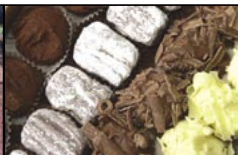
Rumsey's Handmade Chocolates, Bucks